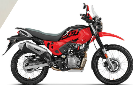
Black Sports Red