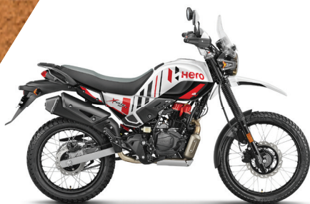
Rally Edition White (pro variant)

Pictures shown are for illustration purpose only and may not be exact representation of the product. It is our endeavour to constantly improve the product. This could lead to change in product specifications without any notice. Accessories & Feature shown may not be part of standard fitment. Actual colour of the vehicle may differ from those shown in the picture.